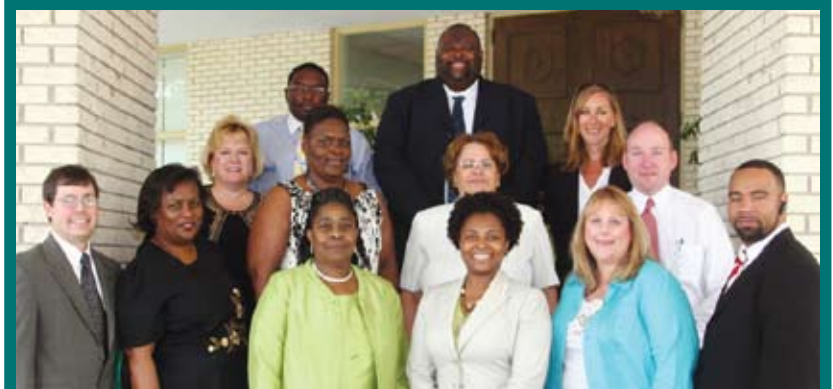
Leadership Washington County Class of 2010