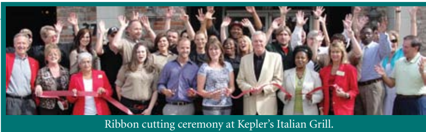
Ribbon cutting ceremony at Kepler's Italian Grill.